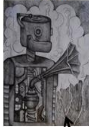
Level 4/5 Make your work look more creative