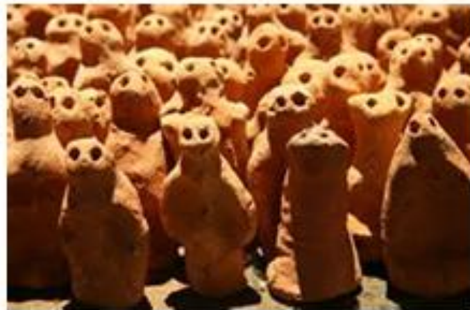
Field of Dreams

Antony Gormley has made sculpture that explores the relation of the human body to space. Gormley has created figures from wire, so as to make the inner space visible, emphasising the imaginative potential and openness of his sculptures. It consists of 287 figures and the place where the sculpture is placed, is very important. Volunteers aged from two to eighty-five years were moulded in plaster by teams of specially trained staff. These moulds were then used to construct the individual sculptures by welding the steel elements together inside each mould. Each piece was constructed from stainless steel bars in eight different lengths. The bodies in DOMAIN FIELD are ABSTRACT but nevertheless relate to a real person in time.