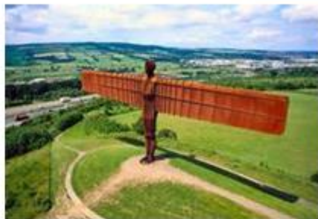
Angel of the North

The Angel of the North is a contemporary sculpture, designed by Sir Antony Gormley, located near Gateshead in Tyne and Wear, England. Completed in 1995, it is a steel sculpture of an angel, 20 metres tall, with wings measuring 34 metres across. The wings do not stand straight sideways, but are angled 3.5 degrees forward; Gormley did this to create "a sense of embrace". Most of the project funding was provided by the National Lottery. The sculpture was built at Hartlepool Steel Fabrications Ltd using CorTen weather resistant steel. It has been considered to be a landmark for North East England. The angel has three functions - firstly a historic one to remind us that below this site coal miners worked in the dark for two hundred years, secondly to grasp hold of the future, expressing our transition from the industrial to the information age, and lastly to be a focus for our hopes and fears - a sculpture is an evolving thing."